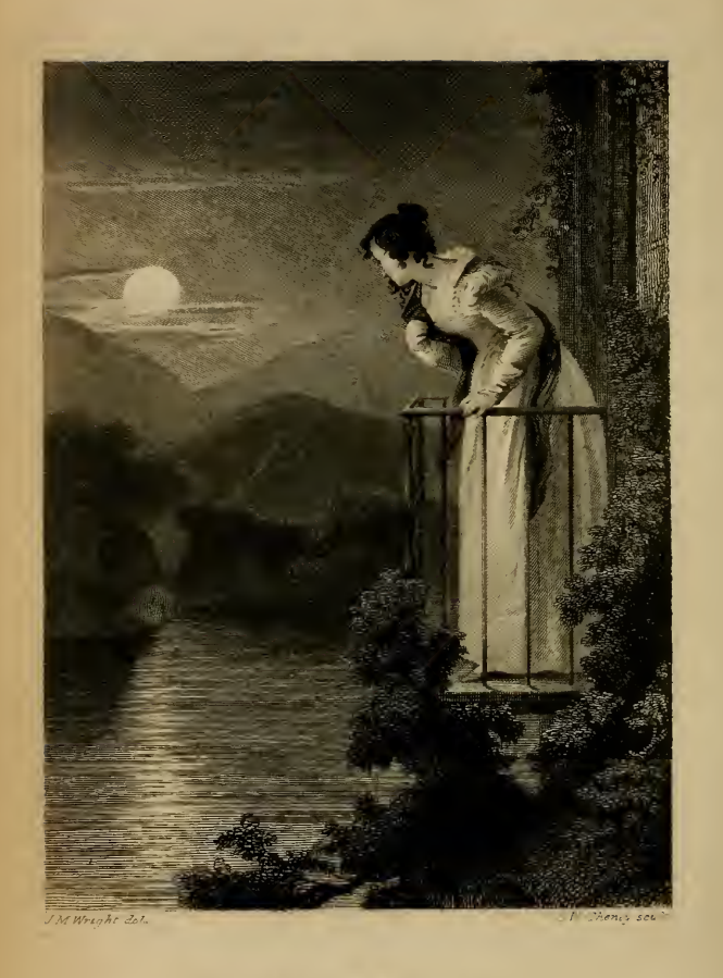
WI INVILLIBIO SEREM. OER.